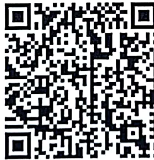
QR Code for retotaling

*Notice regarding matching will be published on the MEC website at a later date.